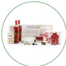
PSK with NingXia