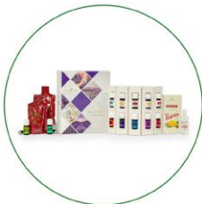
Basic Starter Kit

Your initial investment of a starter kit and a 50-100 PV monthly purchase thereafter is all you need to begin and maintain your business.