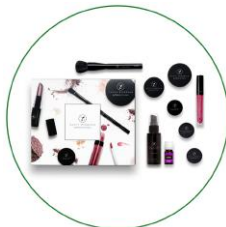
PSK with Savvy Minerals