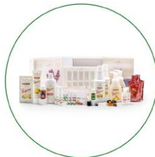
PSK with Thieves