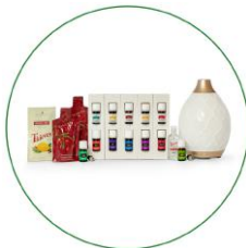
Premium Starter Kit